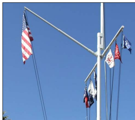
Everyone is here!