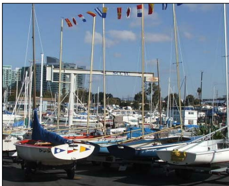
Lidos guard the perimeter