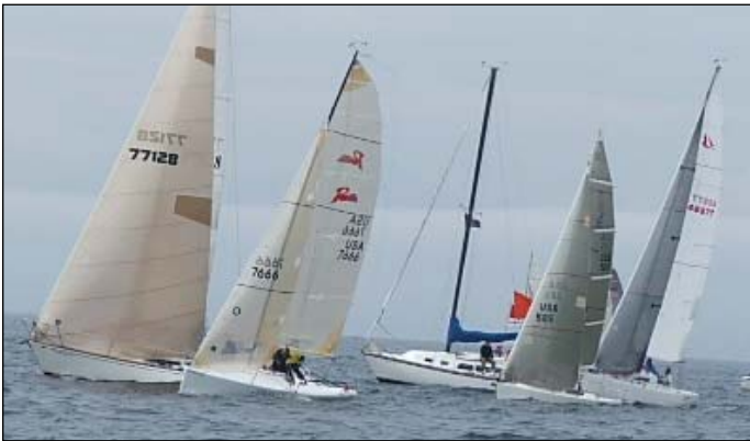
The PHRF Fleet makes a clean albeit close start.

Saturday saw mostly cloudy skies with winds averaging 8 knots and little swell in the first 2 races. As the third race sequence started at 3:15, winds were above 10 knots and the skies grew threatening but, with short 2-3 mile courses, racers crossed the finish line under spinnaker and headed for the breakwater. Just enough rain fell to create a nice rainbow to the Southeast.