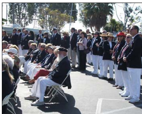
Distinguished guests await their turn to be recognized