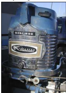
45 1959 Horses

I'm looking forward to the racing season getting into full swing with the Wednesday night series in a couple of weeks and my fifth consecutive Ensenada race in three weeks. It's so easy to plan to compete in all the distance races in the beginning of the year but, after pounding into head seas for hours on end on the return of a 300 miles roundtrip, it's far easier to think of sitting poolside with a daiquiri.