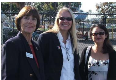
The lovely ladies of SCCYC