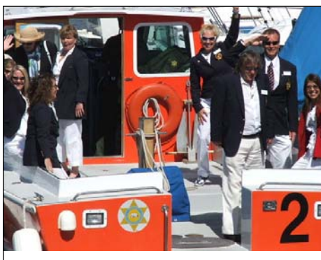
Dignitaries leaving in style (but only a few on the dock at a time)