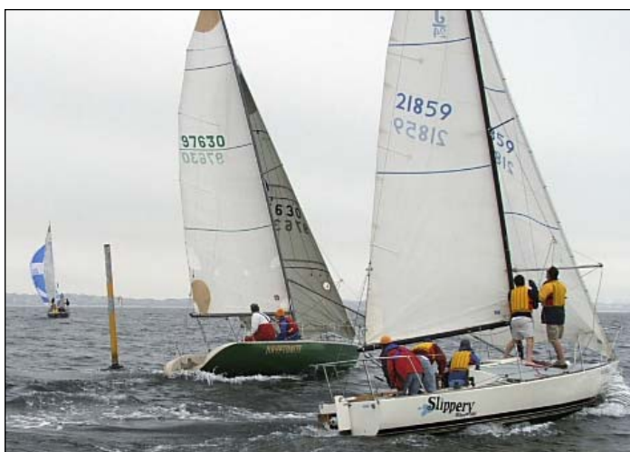
B-Fleeters, Kryptonite and Slippery When Wet ready to hoist