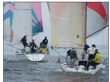
Classes mixing it up under spinnaker