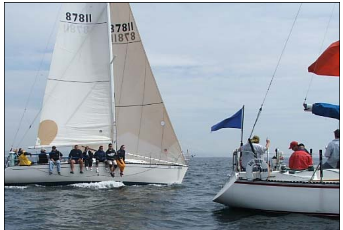
Booyaa! waits for their oh yeah!