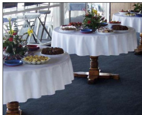
The white tablecloths are only for company...