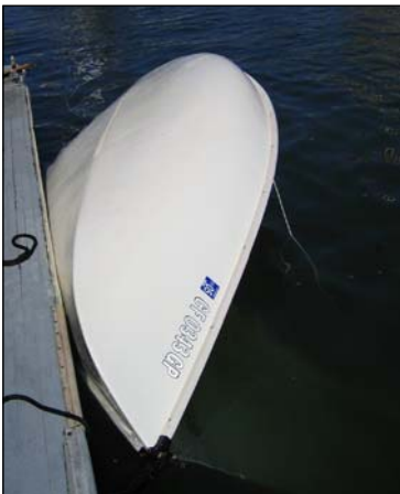
My Kingdom for a Keel

We both got the boat ready for a sail. About 20 minutes later we left the club and headed out into basin "G". All seemed well but when we went to make our first turn once in the basin (out of the slip area) it seemed as though our centerboard struck something. We both felt a hard hit and flew to the front of the boat. At this time we were both in shock and did not know what was happening.