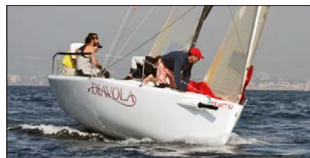
Why Lifelines are a Good Thing.

S B Y R C ’ s C h a m p a g n e series has seen some great performance with the team of