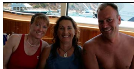
The "Will Be", the "Was" and the "Is" on the Commodore's Cruise

Tracey and Sandy downsize from the Carpe Diem harbor around 10 am, I was poolside at home by noon! The main difference in crossing the shipping channels at 29 knots compared to 6 knots is that the big container ships are far away when you first see them and are still far away when you've crossed the lanes. There were plenty of open moorings at Emerald Bay and I predict we will have plenty for our Fletcher Cup weekend next month.