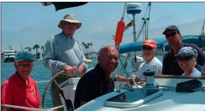
The Reliance and Taku crews relaxing Dockside in San Diego

Earlier in the month, it was our pleasure to 'survive the night' as I joined the Commodore on the flagship, Reliance, to sail/motor overnight down to San Diego. There was actually a little breeze at night to help us out, but the motoring we did, didn't save enough time so settled for a 2nd in our cruising class.