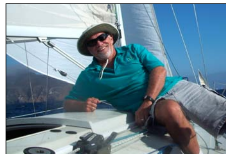
Racing on Island Time

The picture is of yours truly with Anacapa Island in the background one of two marks to round in the Santa Barbara to King Harbor race. I was on a