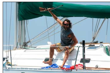
Yes, we gave this man the gun

The Open 5.70s were racing at Huntington Lake for the High Sierra Regatta and with 5 less starts and finishes, it was an easier day on the R/C.