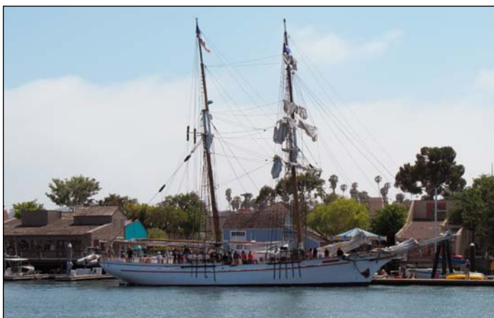
The Topsail Program is looking for Volunteers to help sail the Brigantines