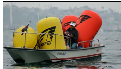
Fenders on the inside of the Markset Boat