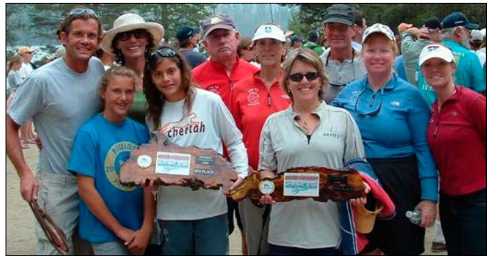
Most of the Fleet 2 Contingent at Huntington Lake

At this writing;, the Commodore's Cruise is underway at Catalina Islands Two Harbors, and probably the B-B-Q is well under way. There should be a report from that group in here somewhere.