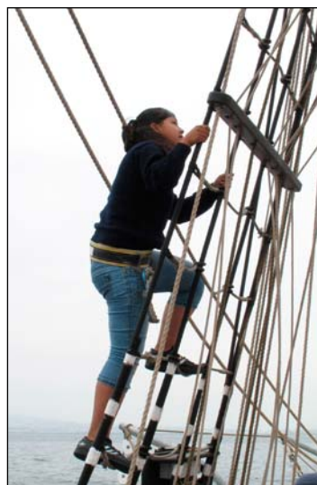
The ratlines are the only way to the yards and the topsails.

You may be thinking “I don’t have $4,000 to take some kids out sailing on a tall ship.” Most major cities, and some states, that are on the ocean have an organization operating a tall ship that is funded to teach sailing to “at risk” youth. If you have teenagers, you know that all kids are “at risk”. And the sailing organizations all know charities that fund their programs! In my case a really great organization, Los Angeles Bridges, provided all the funding but there are many similar organizations in other cities. The people running the tall ship program should have the information on who to contact. Who knows, you may find some good crew that will be around for a few years, and have a great time out sailing!!