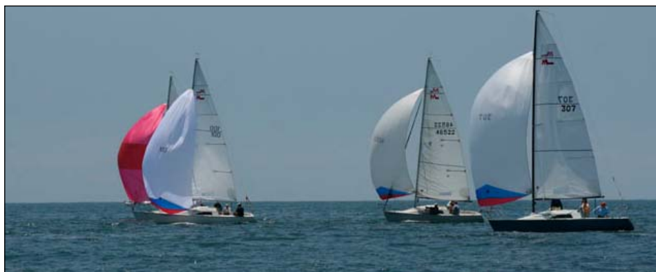
After a day of hourglasses, forestay wraps, botched Mexicans: Spinnakers in their proper positions

After the success of last year's "Dropped marks" race, the race committee set up 2 inflatables upwind, 2 inflatables for leeward gates and 2 flags for the start and finish lines with the entire course North of the Olympic circle. With the winds fairly constant on