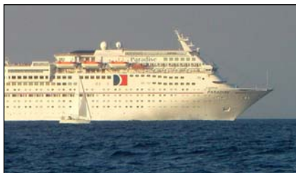
Cruising Class on the San Diego Race

July was a busy month with Reliance racing in the Channel Island to MDR and MDR to San Diego Race the first 2 weekends. The San Diego race is 35 miles shorter than Newport to Ensenada but the best part is when you finish, you're in