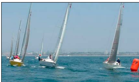
Understood, someone Overstood

The annual SCCYC One Design Weekend regatta was held under 8-12 knot winds in warm, partly cloudy skies on Saturday and Sunday, July 19-20, 2008. Six Schock 35s and 8 Martin 242s joined us for two days of racing while 4 sportboats raced around the Marks on Sunday.