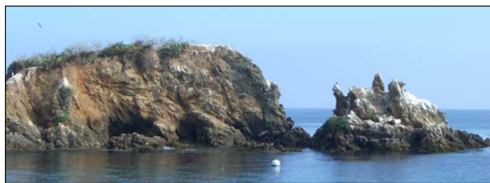
Can you name this rock formation?