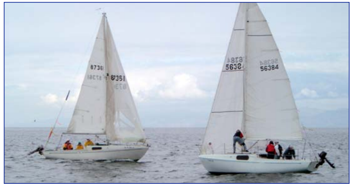
The Arch Rival Columbia 24s Cross tacks before the start.