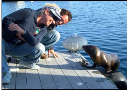
The Seal Lion Pup at the Corinthian Cup

This summer has been a whirlwind of activities on the water and at the clubhouse. Since the last Beacon came out we hosted the Corinthian Cup Race with our friends from Redondo Beach Yacht Club over the Memorial Day Weekend to kick off our Summer Season. Special thanks to all who made the event a success.