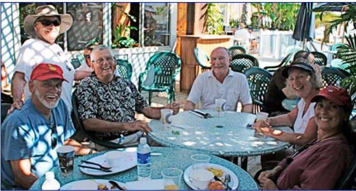
The day starts with a Great Breakfast