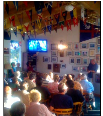
The Full House at the Channel Islands Seminar Enjoying the Wide Screen View