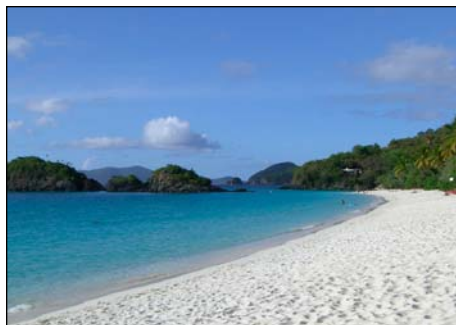
Cinnamon Bay in St. John, USVI