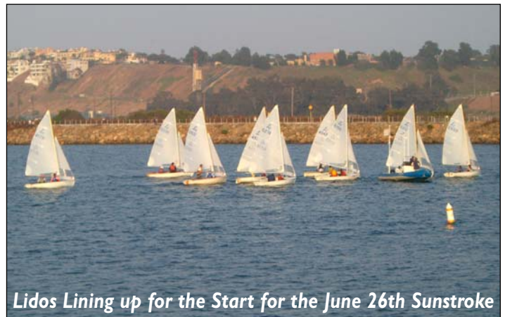
Lidos Lining up for the Start for the June 26th Sunstroke