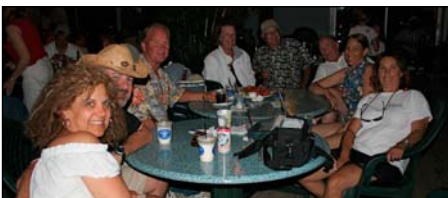
Yet another table for the Cruisers