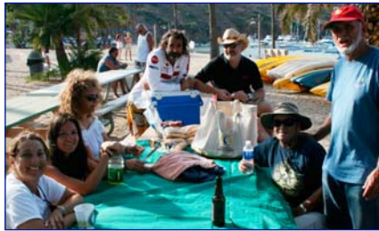
Dinner on the Beach Caps an Active Day

The June cruise started out with solid fog. A complete white out, thanks for my radar we avoided two freighters dead ahead with almost no forward speed. On the radar it looked like a solid mass in the middle of the sea, then OH MY GOSH there they were! The fog was so dense we had to get an escort from the Isthmus Harbor Patrol to my mooring. 25 years of entering that harbor and I couldn't get in without worrying about hitting moored boats.