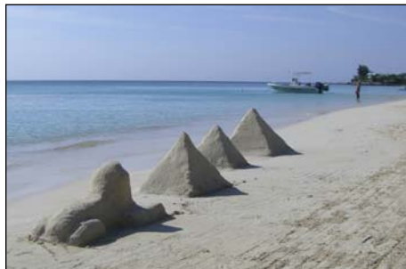
Giza comes to Roatan, Honduras