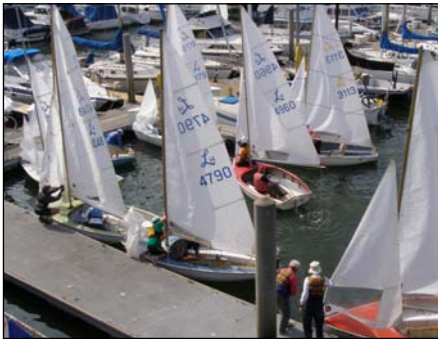
The Parking lot was full Dockside

Trophy presentation and post race BBQ at South Coast Corinthian Yacht Club was a well attended raucous party.