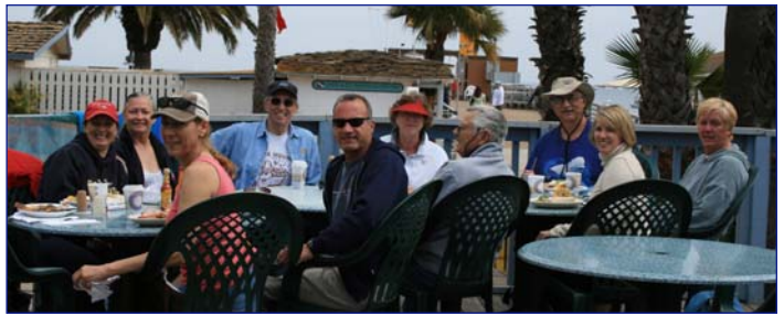
Breakfast Al Fresco is hotter with Tabasco

WSA sailors and our gang made do with our own snacking and sharing just as if we were up at the lodge. The