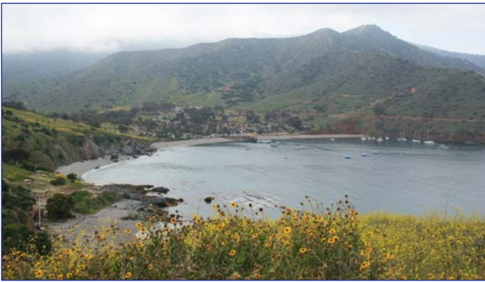
The Isthmus was in full bloom