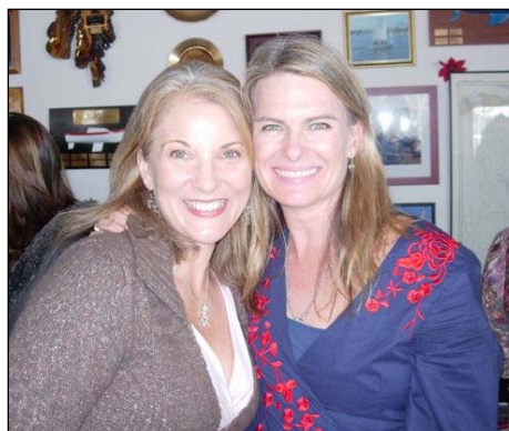
Our Birthday Girl Celebrates with friends