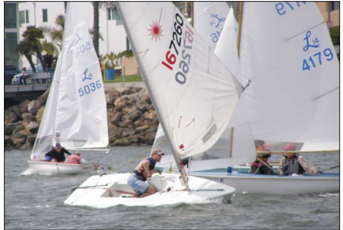
Lasers and Lidos Crossing Tacks

SCCYC and Lido Fleet 2 volunteers did a super job of race organization and hospitality. Trophies and prizes were generously donated by regatta sponsors Quantum Sails, Ullman Sails, Annapolis Performance Sailing, West Marine, Sailing Sport Boats and Double Wave Marine Sales, Service and Technology.