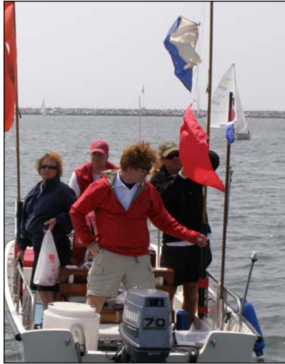
Flags a-flutter aboard the Whaler

4th in the MDR channel. There was a big turn out of local boats and visiting racers came from as far away as Ventura and Newport. Conditions were perfect for a dinghy regatta, the marine layer lifted, the wind came up and the starts were hotly contested and exciting enough that after three general recalls in the A fleet race committee hoisted the "I" flag, much to the B fleet's delight. The last race of the day was an optional 6th fun race to the club, 28 boats on the start line all beating to weather until the 1st boat rounded the weather mark, then everyone turned and ran for home. Trophy presentation and post race BBQ at South Coast Corinthian Yacht Club was a well attended raucous party.