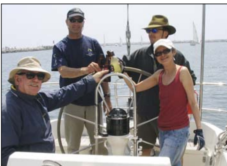
Papalagi's Crew toasts their success.