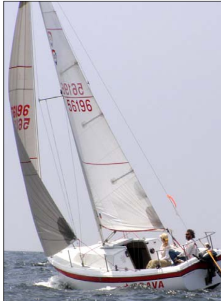
Gimmy and Brava led the Columbia 22 fleet around the course on both days.