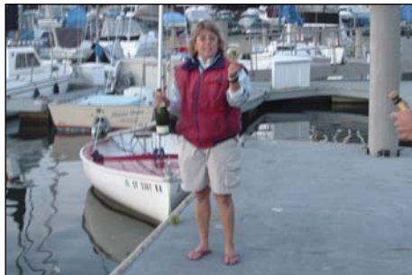
Champagne and a Tuna Can Lid

officially unveiled her more modern sounding Transitio , named because the "N" had fallen off the transom a while ago.