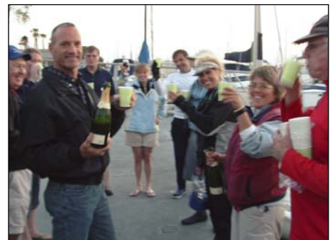
Champagne is the essential ingredient for any boat renaming celebration.