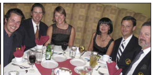
Members enjoyed the ceremonies from the cozy booths.