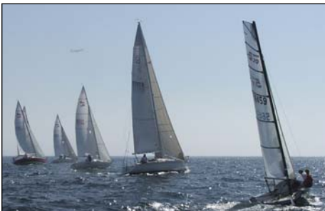
Six Boats get a Clean Start in Clear Skies in Race Number One

With the wind steady at 235° between 6 and 9 knots, the fleet start-