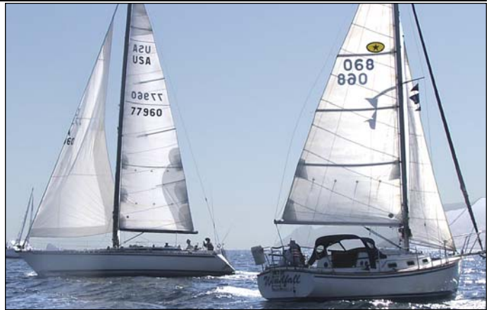
Papalagi and Windfall at the start of the Fletcher Cup Race