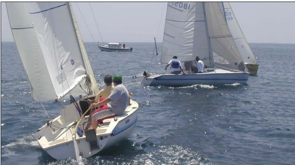
The SFVYC Holders Fight for Position at the starting flip of the sign