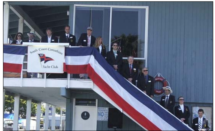
The Board Of Directors Get a Great View on Opening Day

Secretary – Primary duties include keeping records and communications of Club activities, preparing the agenda for each Board of Directors meeting, recording of meeting minutes, and handling of membership related tasks.