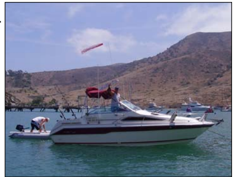
Enjoying the Calm of Cat Harbour

17th at 10:30 in the canals of Venice. A map with a starting point will be sent to you via email next week. A Potluck BBQ will be at the club house afterward, approximately 2:30. Bring your own bbq item and a dish to share with others.