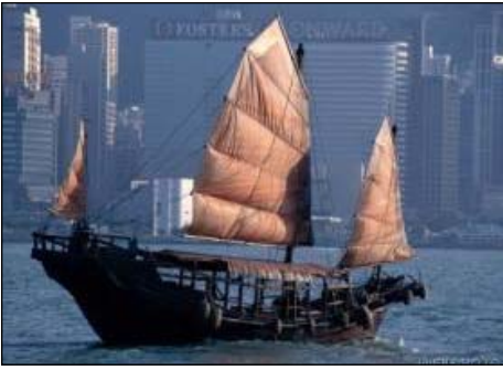
Not the Usual G-Basin Junker

ried by Dockers to the sheds. A man would carry two sacks of cement on his back while running down a 200yd pier. A lot of the junks were sail only. The Mao Cultural Revolution was in full force but, as China still had to import and export, a lot of goods went though Hong Kong, carried to and from the mainland on sailing junks. The harbor was therefore very busy. I went out on a private 60ft junk and was amazed how easy they were to sail, to raise or reef the main, what great visibility one has from the 'poop' deck. It was exciting weaving through the maze of boats especially as the mainland Chinese used very inch of their "right of way" while trying to give you a Red Book of Mao's sayings.