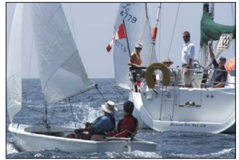
Reliance is the Best Place to Watch Starts pulled away from Susie.

The next leg, back to the committee boat, we sailed rhumb line and