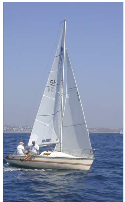
Winning Holder Capt. Jack Sparrow's Chum Bucket