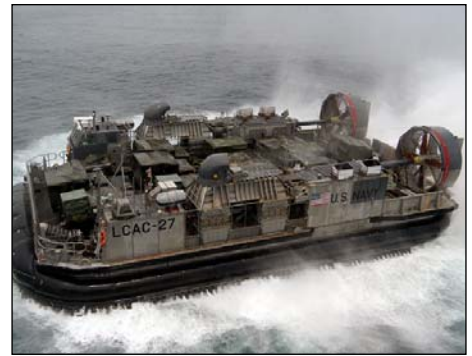
Watch for the Flashing Yellow Light!

We were making a film for the Marines so I explained to the liaison officer what we needed. "No problem, however you cannot do it