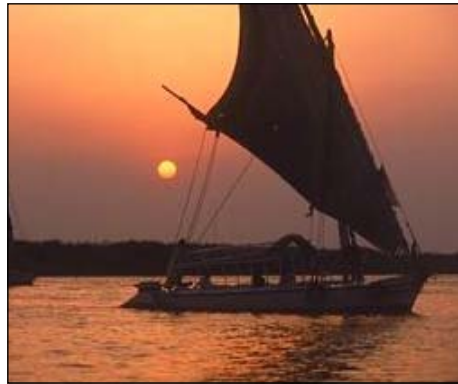
What's the Sign Language for Felucca?

dilapidated Felucca that looked as old as the bible with an captain who must have been as old as the boat. The Nile current is strong. The captain untied the boat and let the current draw us away from the shore. With no apparent effort the much patched sail was up, adjusted for the strong warm evening desert wind and we were stemming the current and working our way upstream. We sailed for a couple of hours. Not a word was spoken. As the calls to prayer finished a relative peace settled over the city (traffic noise is a constant). Sometimes he would give me the tiller, strong weather helm, and other times I would sit and meditate on the timeless nature of boats and boating people.