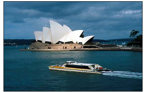
Sydney's Picture Postcard Harbour

On the way back to Mull we went to look at the Island of Jura Whirlpool. It is in a narrow rocky passage between two Islands. At high water slack tide the passage was calm but eerie. Later, flying over in a helicopter, I saw the whirlpool in full force and fury. A