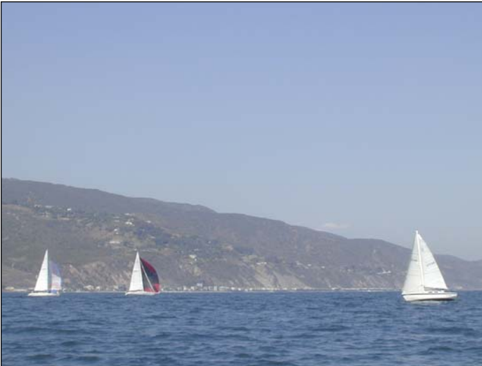
Off the coast of Malibu in our July PSSA race