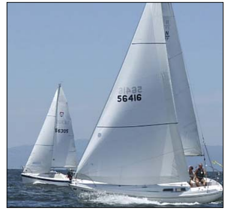
Banana Wind and Jury-Rigged Charge at the Starting Line