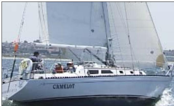
Camelot show the side of her that is becoming increasingly common for MDR sailors. The part of the boat pulling away!