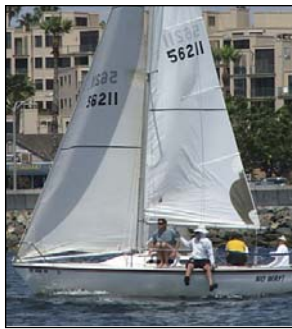
No Way after crossing the winning line in King Harbor

The winner in each class was based on the total time for both race days. Keeping their titles for two years in a row are