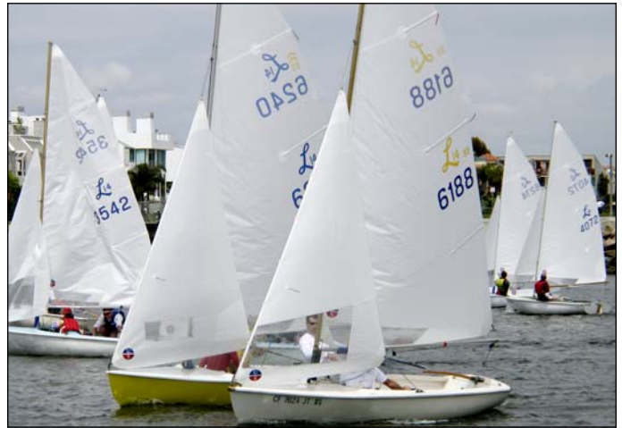
A Fleeters Beat to Windward

On learning of our race group, just before the