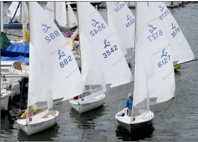
The Action Gets Really Close Preparing to Park at the Dock.

could not get out of my comfortable position fast enough. We had half filled up before I could push my weight back to get the rudder back in the water to get the boat upright. By the time we got to the lower mark we had bailed the boat dry, were way behind the others and Sandman was kindly telling me that he had been at the back of his fleet just a couple of seasons ago.