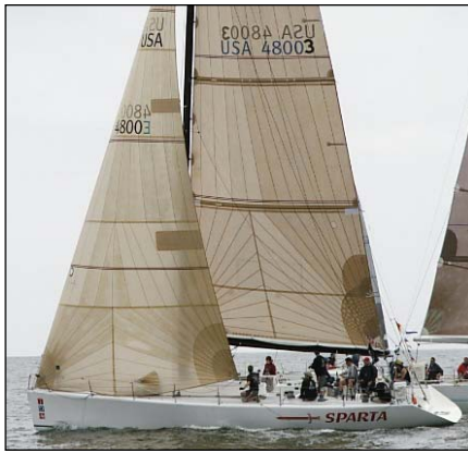
Sparta Charging before the start with their "A" Sails