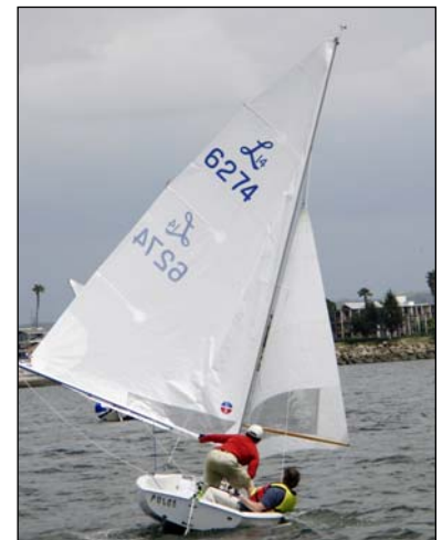
Pulce with 2 men in a boat

We followed the other 6 boats up to the windward mark, falling further and further behind. We had the boat flat, were doing everything by the book but they were going faster. By the time we had rounded the mark the others were 100 yards ahead. Never mind, we had the whisker pole out in a flash, the plate up, the boom vang on, the boat leaning to windward, our weight up front, comfortably settled and were going fast down wind. "Do you think are catching up" I optimistically asked. Sandman grunted in a non-committal way. He then mentioned a squall coming from behind and that we should move over to catch it. We moved over as it hit. The boat broached and I