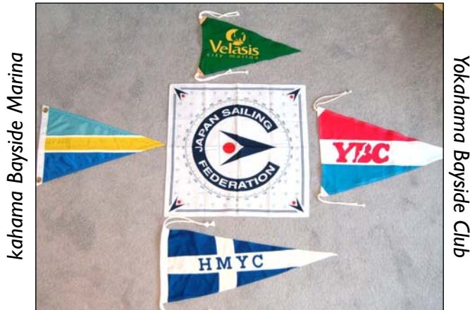
Yokohama Bayside Marina