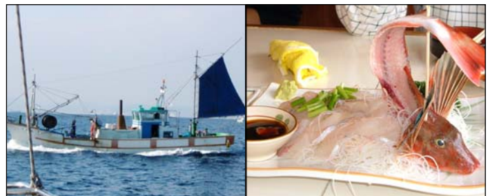
Japanese Fishing boat (Maru?)