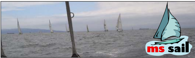
Some of the SCCYC Boats Racing for a Cure