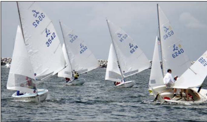
Things sure look tippy without keels