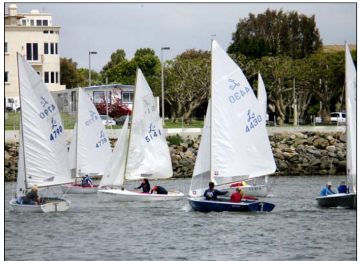
Whistling about during that 3 minute start sequence

Back to the B fleet next time? - Peter B.