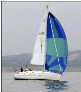
Reliance early in the race still in sight of land

Reliance's title as last SCCYC boat to finish this year, but correcting to the top third in the class due to no engine time is a great reward. I just wish that we had arrived earlier to enjoy our slip at the Ensenada Cruiseport Marina for a bit longer.