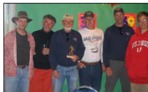
Camelot Pirates the Trophy in the SMWYC Cruiser Handicap

Coming up at the end of the month is our fun dash to King Harbor, the Corinthian Cup Race, co-hosted with Redondo Beach Yacht Club. I hope to see all of our eligible boats participating, including some of our newer boats that haven't raced yet. If you can't participate, we'd love to see you at the Club on Sunday, to help host the racers.