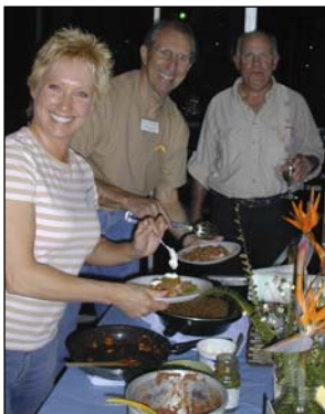
Tacos Warranted seconds