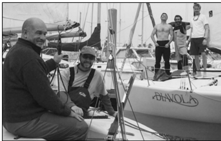
Bandit and Diavola in the hoist Queue

The winds were light all three Saturdays. The first