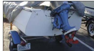
A Weekend Project or the Boat that...