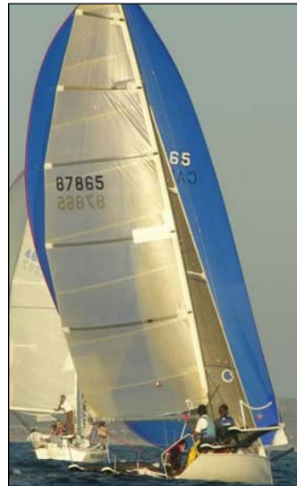
Chupacabra Reaching Downwind