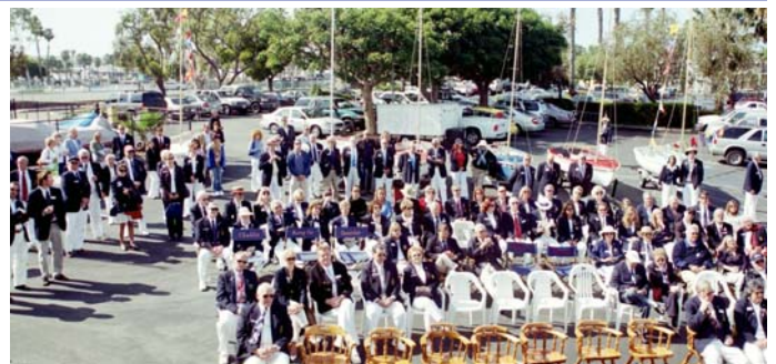
The Lidos corral visitors and members

As the weekend progressed, and our officer's bridge toured our yachting community, I noticed one very unique thing. Our club is petite. It is sort of a "boutique" yacht club. However you describe it, our