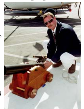
Ready, Aim, BOOM

Lastly, the new BBQ is spectacular! However it has a safety feature that you all should know about. The Propane Gas tank must be turned off after use. If not then you will have problems firing up the grill the next time someone uses it due to a safety valve in the connection hose. The procedure is, turn on the gas valve on the propane tank first but only if it has been off and cooled off then turn on the grill knobs to Light Flame then press the magic button on the face of the Grill and you should have no problem. This model does not use lava rock, so don't panic. Please keep it clean and turn off the propane and cover the grill when you are done. It should give us years of use as many of the connection parts are stainless steel and the grill itself is cast iron!