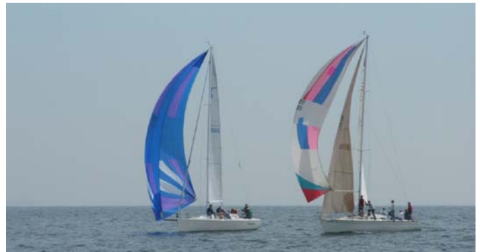
Persistence and Booyaa in the Les Storrs Race

I'm sure there were many volunteers I failed to mention by name, let me say Thank You All.