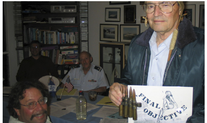
USCG Aux sharing stories and safety at the clubhouse

The Coast Guard Auxiliary was originally dubbed the Hooligan Navy since they were composed of patriots who were not eligible or weren't drafted for Military Service during WWII.