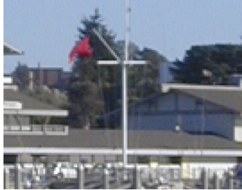
Small Craft Warning for the Champagne Series makes for spirited racing

While rigging her the wind swung around to the north east still blowing at least 15, hard to tell without being able to see the sea state. We had