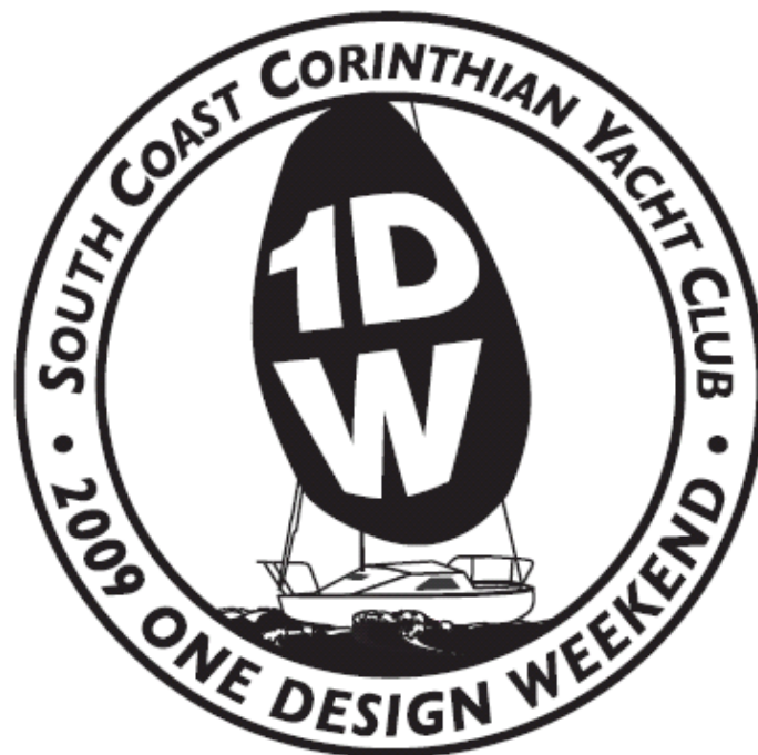
Trophy Glass Design