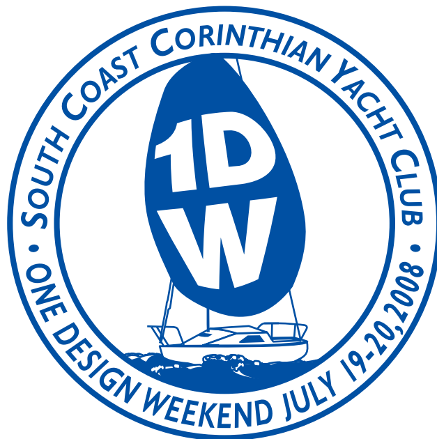
Trophy Glass Design