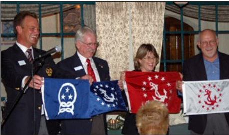
The Commodores display their new flags for the first time. (What does the Staff Commodore's burgee's lack of an anchor signify?)