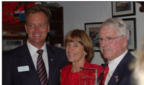
Outgoing Commodore gets to pose with the Incoming Commodore and Commadorable, winners of the Russell Road Lido Trophy