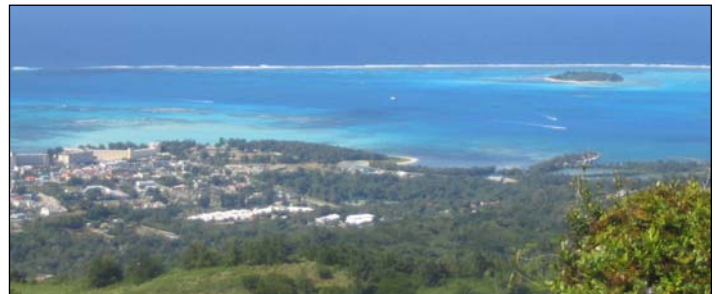
Island hilltop view

A favorite island habit is chewing beetle nut. Similar to chewing tobacco, the nut is placed in the mouth and the spicy juices swirled then spit. Local sidewalks and old-timers’ teeth are deeply stained red by the juice. Chewing the nut produces a mild narcotic buzz; importation of the nut into the United States is forbidden. I sampled the nut, which I liked just about as much as I like a lip full of chewing tobacco ... I was not tempted to smuggle nuts home.