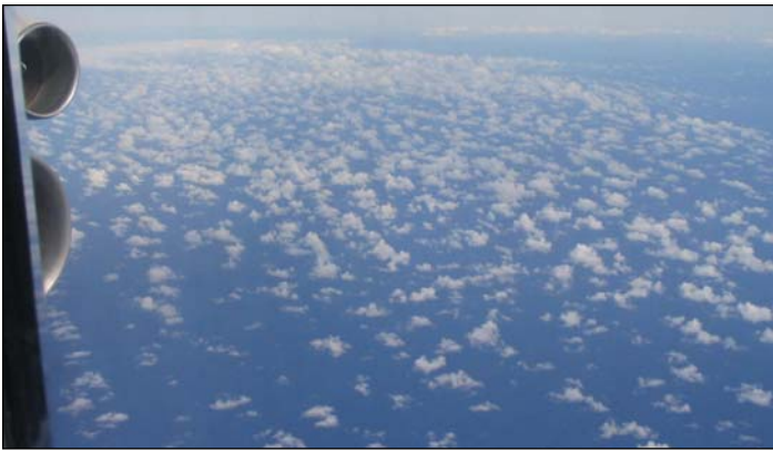
Nothing goes to weather like a 747