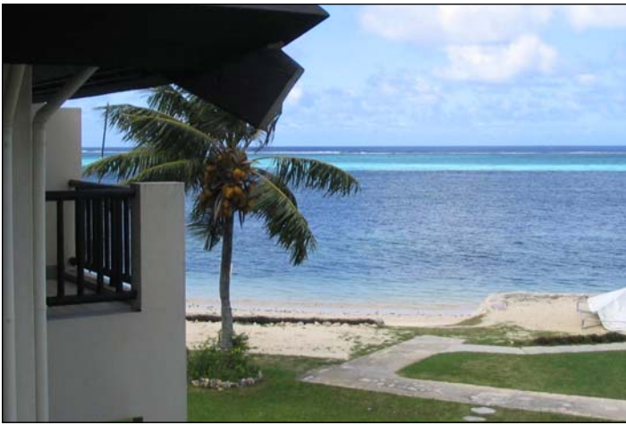
Hotel view & reef