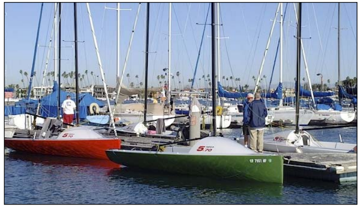
The Open 5.70s dockside at one of their slower speeds.

Not a bad start, but certainly not the best. We were a tiny bit late, but this is not my boat and I want to be careful with it. We went a bit to the left on Port but on the Starboard end of the line at the start, everyone else headed off on Starboard headed to the left. Nik tacked away to cover me, but Jerome had Geoff and Arnoud pinned over there on Starboard. I tack to the first windward mark having banged the corner with Nik just ahead of me. Jerome purposely took everyone past the layline and finally tacked which puts me in third because Geoff and Arnaud have now overstood and are on Port Tack and I and Nik are on Starboard headed for the mark. So I have already come from last at the start to 3rd at the windward mark, thanks